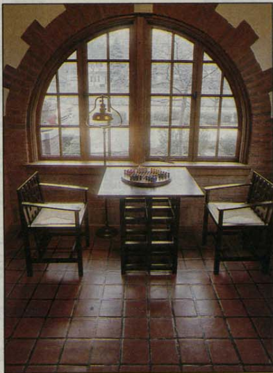
A game table and chairs well suit the wood-and-brick architectural setting on the porch.