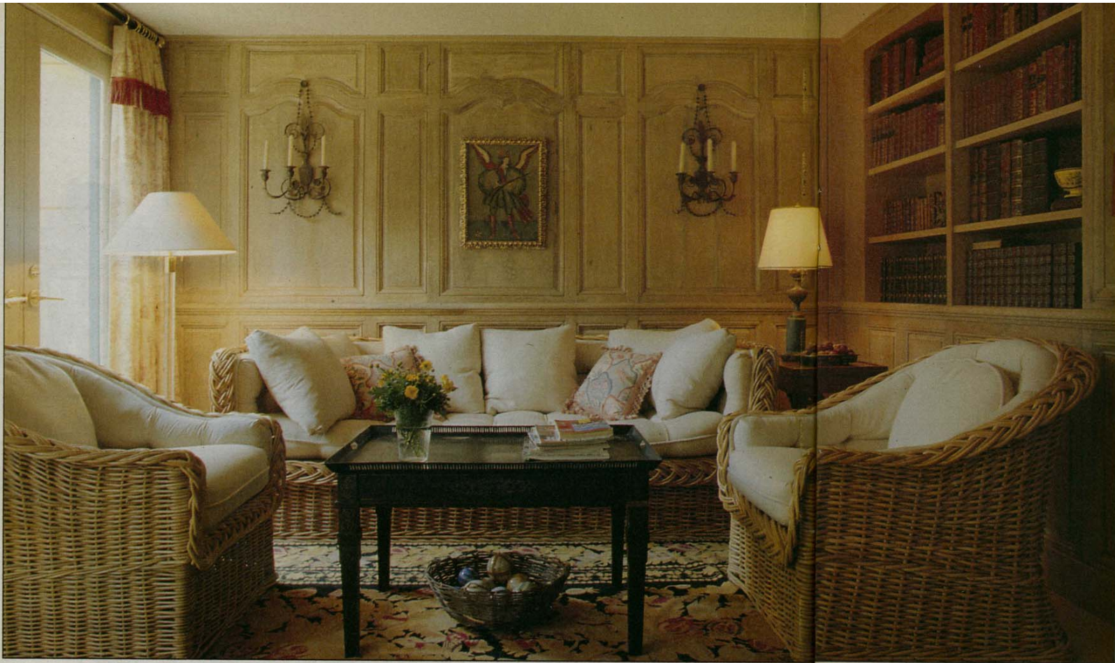
A ROOMFUL OF ANTIQUE FRENCH PANELING WARMS THE LIBRARY (ABOVE), WITH ITS RELAXED WICKER FURNITURE, WHILE A SUITE OF OLD ITALIAN PRINTS IS SET ABOVE THE DINING ROOM'S DOORS (RIGHT).