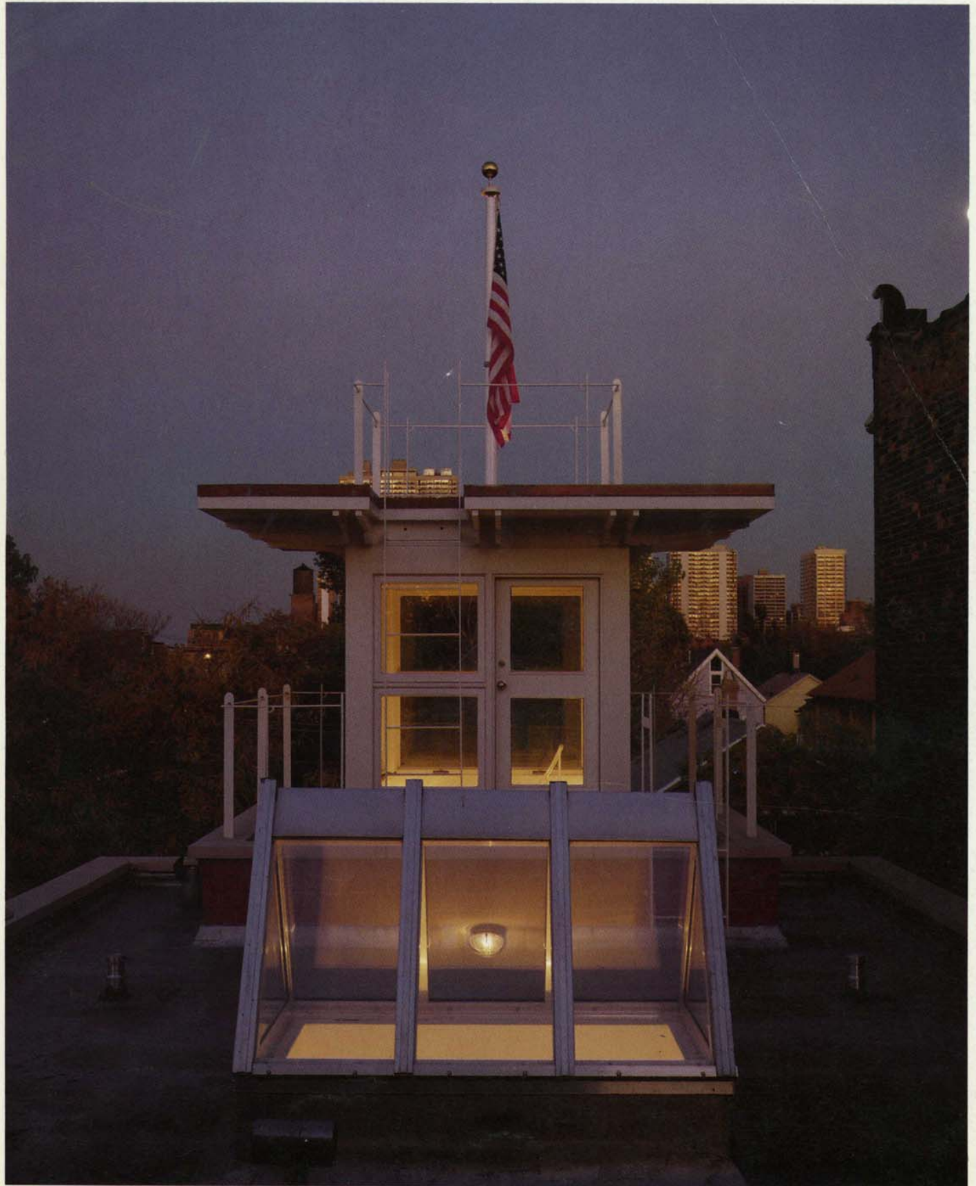
THE CHICAGO VILLA II · RAYMOND KASKEY · CARL MILLES